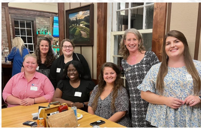
GKCU employees at Chamber Business After Hours

GKCU employees take every opportunity we can to help our members, our coworkers, and our community. The holidays are a great time to reach out and make a difference with community giving, professional networking and school presentations. We hope you will continue to invest in us so we can, in turn, invest back into our partners and neighbors. We can give back because you first trust us and we carry what we know back out into our communities to make it better for us all.