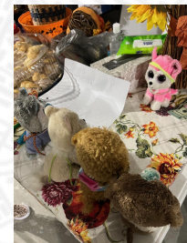
Impromptu money lesson at CMD Pantry with a girl and her fur-friends.

From all of us at GKCU, Merry Christmas and Happy Holidays!