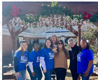
GKCU employees at Prince George Nursing HealthCare for United Way Day of Caring