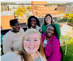
GKCUC employees at Emerging Leaders conference

GKCUC employees take our jobs seriously. That means continuously learning new ways to serve you. From improving on our member service to learning more of the credit union difference, GKCUC is developing financial leaders who are equipped to help you make the best decisions for your wallet. And we even get into the community too, to learn about what affects you and the future for our communities. Thanks for your trust in us as your financial partner and letting us grow better for you!