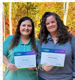
GKCUC employees at CU Principles and Philosophies conference