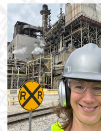
Touring businesses to be better community partners.