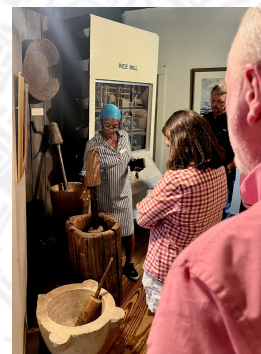
Visit to the Rice Museum with our friends from IP Georgetown Mill