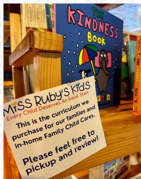
Mentoring with Miss Ruby's Kids