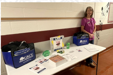
Back to School at Browns Ferry Elementary

GKCU is always about learning! From our CU Save Days at local schools to mentoring in our schools to enrich our student's success, we are proud of the efforts we play in our community to make it better for us all. Recently, however, we got a chance to remember where we came from and the strong, rich history we have from rice mills to paper mills. If you get a chance, we encourage you to learn more about where we live by visiting museums and guided tours, as well as helping in local schools or civic groups too.